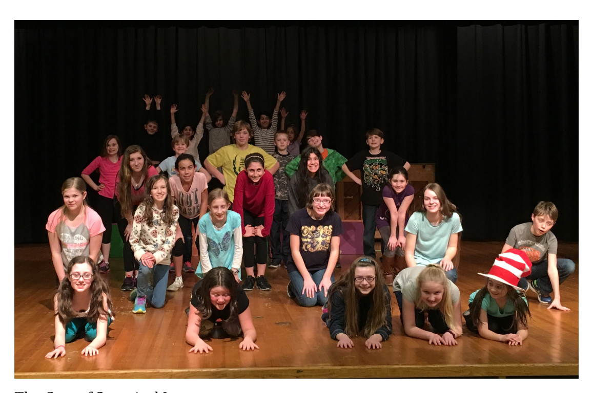
The Cast of Seussical Jr